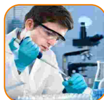
IPQA LAB AND F&D