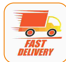
TIME BOUND DELIVERY